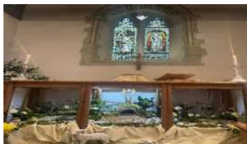
The Easter Garden